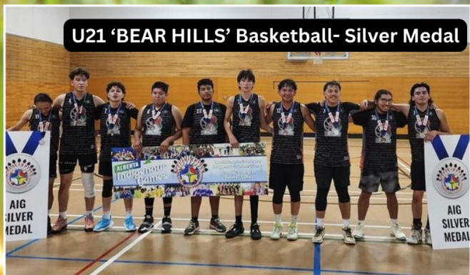
U21 'BEAR HILLS' Basketball- Silver Medal

DISCLAIMER: PLEASE NOTE THAT WE PUT IN OUR BEST EFFORTS TO INCLUDE AS MANY E.C.N YOUTH WHO COMPETED IN A.I.G. 2024, IF WE MISSED ANYONE, IT WAS NOT OUR INTENTION