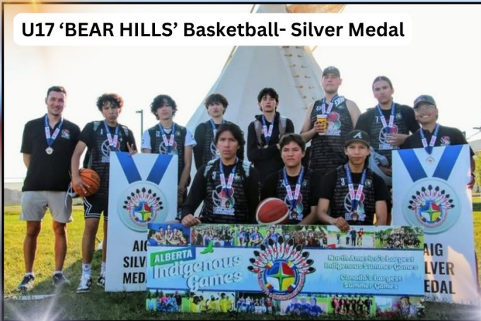
U17 'BEAR HILLS' Basketball- Silver Medal