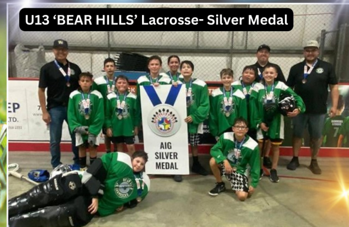
U13 'BEAR HILLS' Lacrosse- Silver Medal