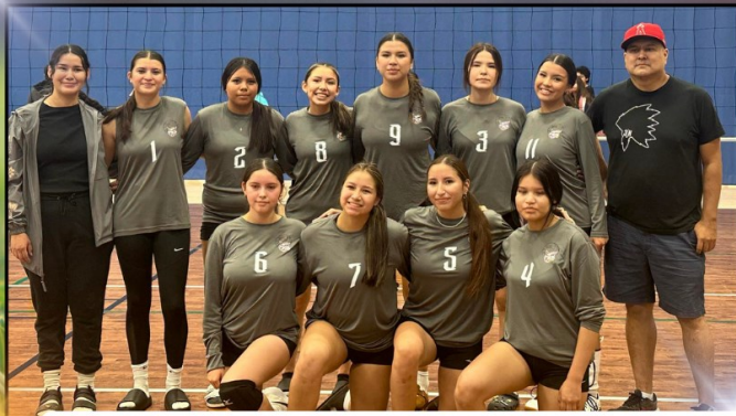
U17 NIPISIIKOPAHK COYOTES Volleyball- Silver Medal