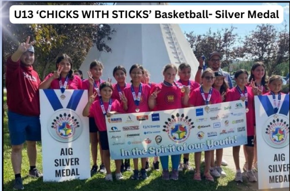
U13 'CHICKS WITH STICKS' Basketball- Silver Medal