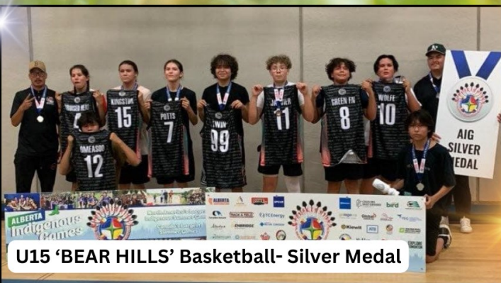
U15 'BEAR HILLS' Basketball- Silver Medal