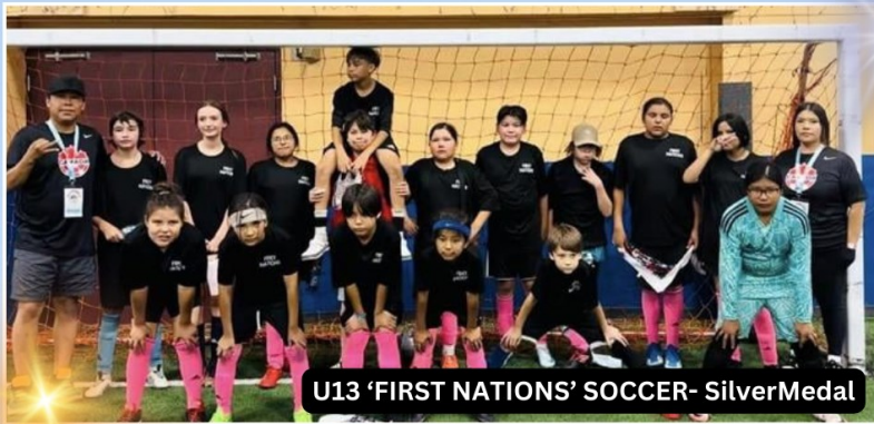
U13 'FIRST NATIONS' SOCCER- Silver Medal