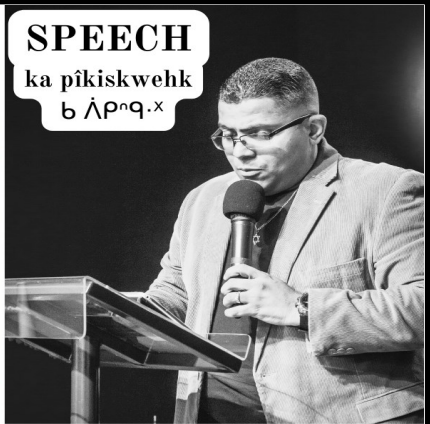
SPEECH ka pîkiskwehk ᑕ ᑕᑕᑕᑕᑎᑎ