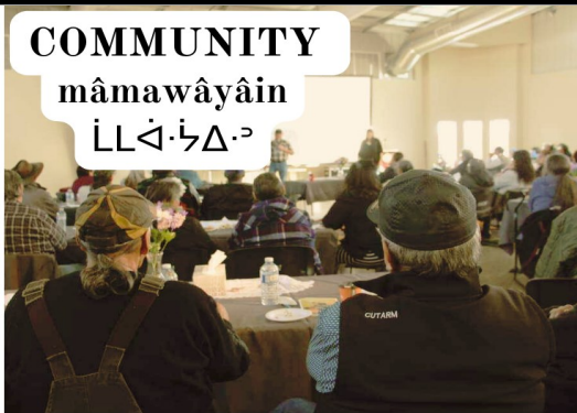
COMMUNITY mâmaxâyâin ᑕᑕᑕᑕᑎᑎ