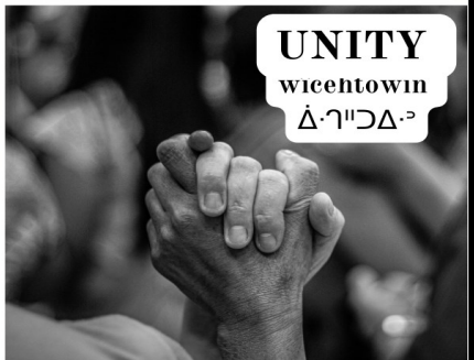
UNITY wicetowin ᑕᑕᑕᑕᑎᑎ