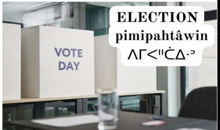
ELECTION pimpahtâwin ᑕᑕᑕᑕᑎᑎ