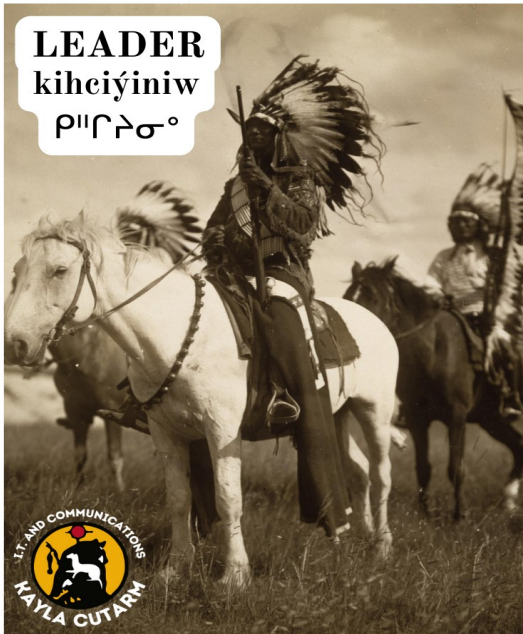
LEADER kiheiýiniw ᑕᑕᑕᑕᑎᑎ